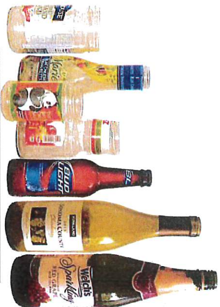
GLASS BOTTLES & JARS (NO LIDS)