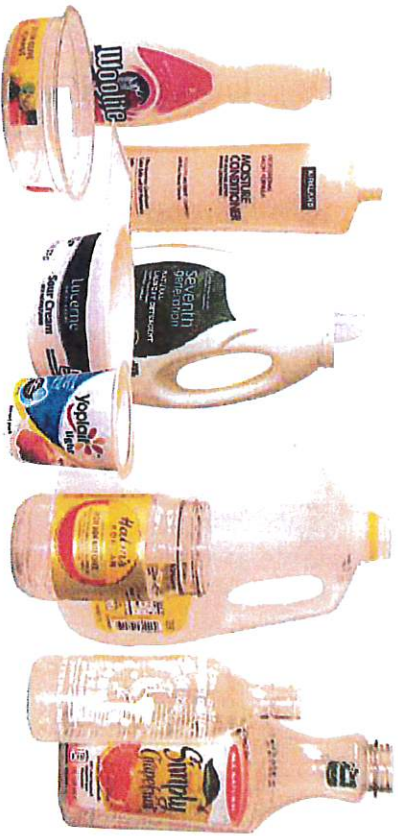
PLASTIC BOTTLES & CONTAINERS # 1-7 (NO LIDS)