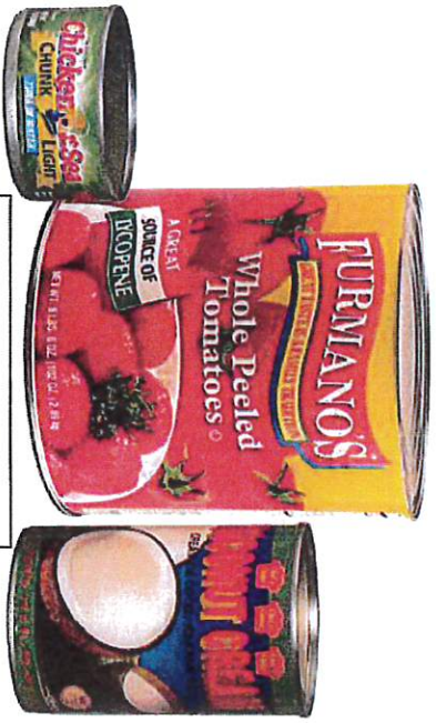
STEEL & TIN CANS

Keep paper separate from your bottles & cans. Recyclables need to be empty, rinsed clean, dry & un-bagged. Throw away caps, lids, straws and tops.