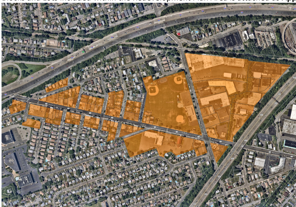
Figure 1: Redevelopment Plan Area

The map below reflects the boundaries of the Redevelopment Plan Area. The full list of Blocks and Lots included within the Redevelopment Plan Area is attached as Appendix E .