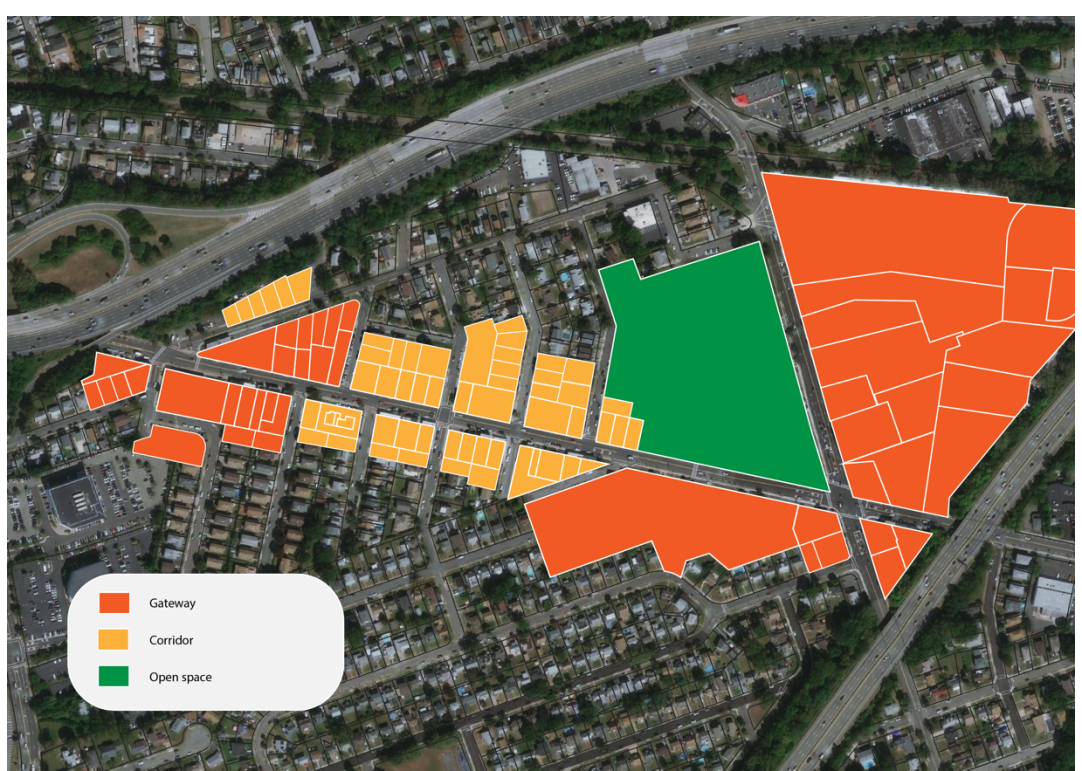
Figure 5: Overlay districts within the Redevelopment Plan Area

The Plan area is comprised of two primary distinct zoning districts: Corridor and Gateway. The breakdown of zoning districts is reflected in the figure below. Appendix E details the blocks and lots included within each zoning district.