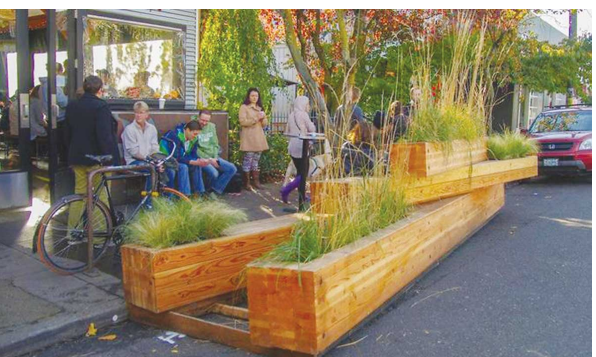
Figure 8: Parklets or outdoor dining may be used to activate interstitial spaces.