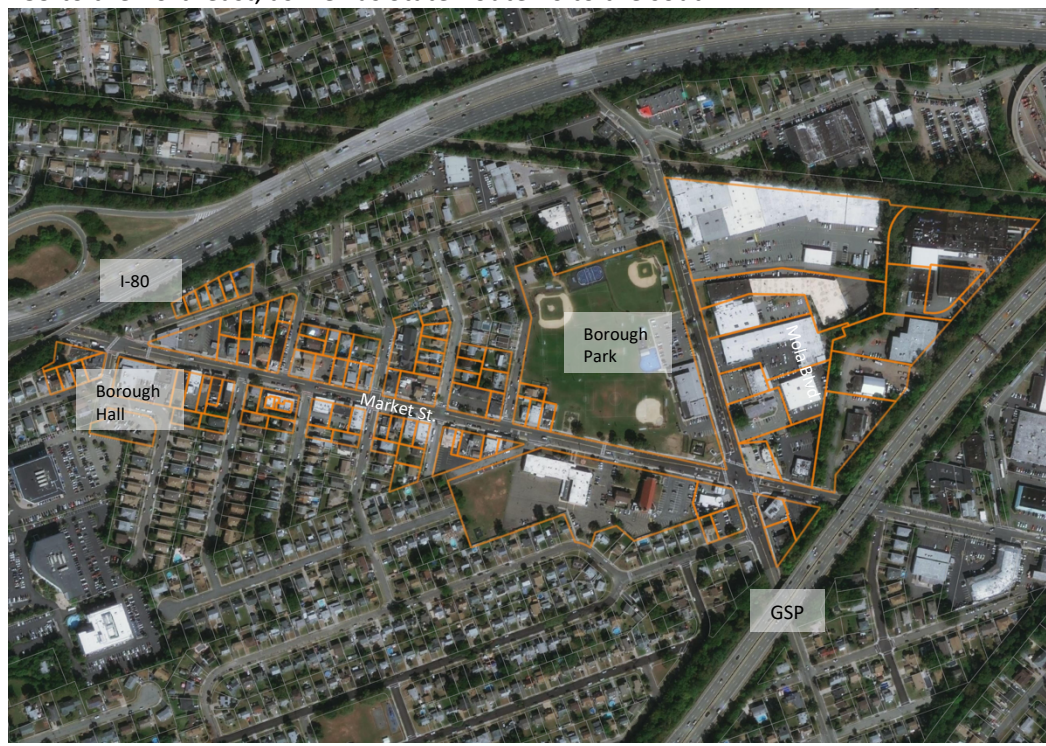
Figure 2: Redevelopment Plan Area and surrounding context.

In addition to the primary access points along Market Street and Mola Boulevard, Area access is also provided by numerous local roads like Van Riper Avenue, Oak Street, Chestnut Street, Church Street, Walnut Street, Locust Street, Elmhurst Street, Beech Street, Pine Street, Terrace Street, Tuella Avenue, and Veterans Place. The Area is accessible from the west via Exit 61 on I-80 and is in close proximity to Garden State Parkway Exit 157 to the southeast and Exit 159 to the northeast, as well as State Route 46 to the south.